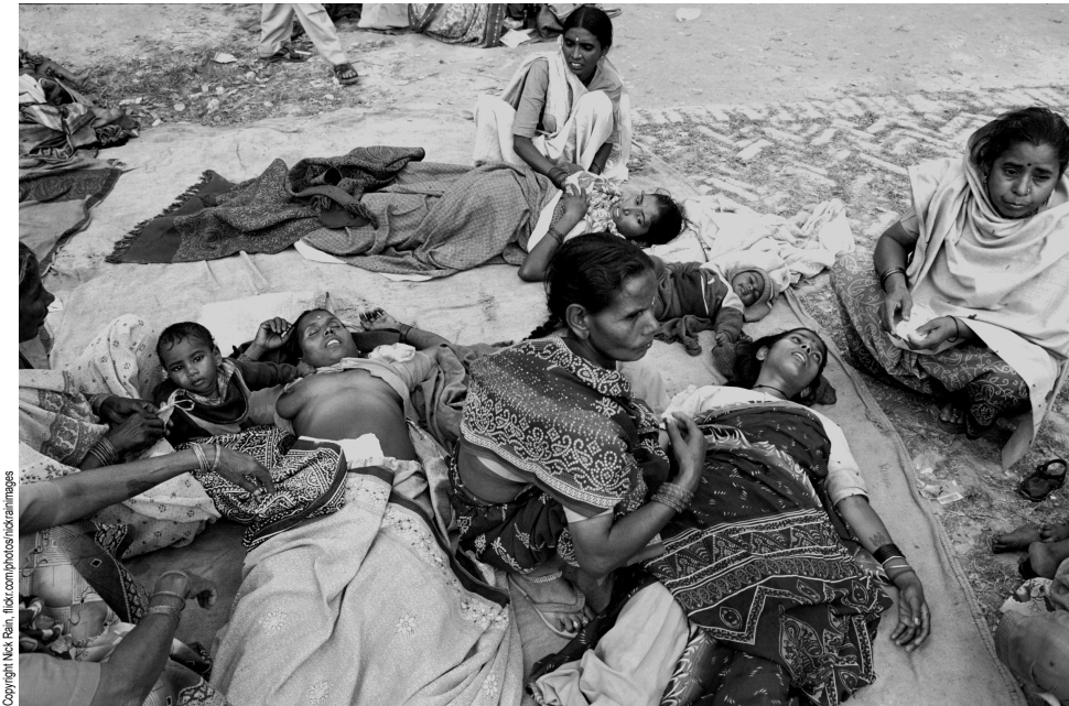
Mass sterilization camp in India.

choice but to go to the United States, hat in hand, to beg for food aid.