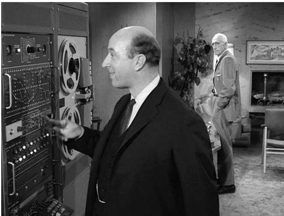
Wallace V. Whipple (foreground, played by Richard Deacon) pokes at his beloved computer (“The Brain Center at Whipple’s,” 1964)

In the fifth-season episode “The Brain Center at Whipple’s,” something of a remake of Dickens’s Hard Times , the outcasts are factory workers who, in the name of progress, are replaced by “automatic assembly machines” that work nonstop, without complaint, and—as the company’s president happily points out—without the bother of pensions, coffee breaks, or powder rooms. Like much science fiction of the 1950s and 60s, The Twilight Zone looks frequently at the bewildering effects of science and technology, including the “battle between . . . the brain of man and the product of man’s brain,” as Serling puts it in the episode’s opening. And yet the series largely avoids the easy portrayal of modern machinery as