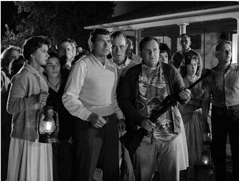
The panicking residents of Maple Street (“ The Monsters Are Due on Maple Street ,” 1960)

Suburbanites also run amok in “The Monsters are Due on Maple Street,” an episode still sometimes shown to students in middle school and high school civics classes. The residents of Maple Street convince themselves that space aliens, masquerading as human beings, have been hiding among them in their “tree-lined little world” as a first step toward global rule. Immediately, suspicions fall upon the local oddball, an insomniac often spotted standing alone late at night, staring at the sky. “Let’s not be a mob!” cries one man—but as the paranoia spreads, Maple Street becomes a frenzied war zone, with rocks and bullets flying. Predictably, the episode is often cited as an indictment of McCarthyism during the “Red Scare,” which is now lodged in the popular imagination as a postwar period of unprecedented tribulation and fear. But the episode also recalls, even more explicitly, the mob-driven irrationalities that fueled the rise of Nazism, still fresh in the public mind in the 1950s, and the subject of several other Twilight Zone episodes. The threat of barbarism, Serling repeatedly suggests, never ends; the margin between order and murderous chaos is thin. “For the record,” asserts Serling at the episode’s close, “prejudices