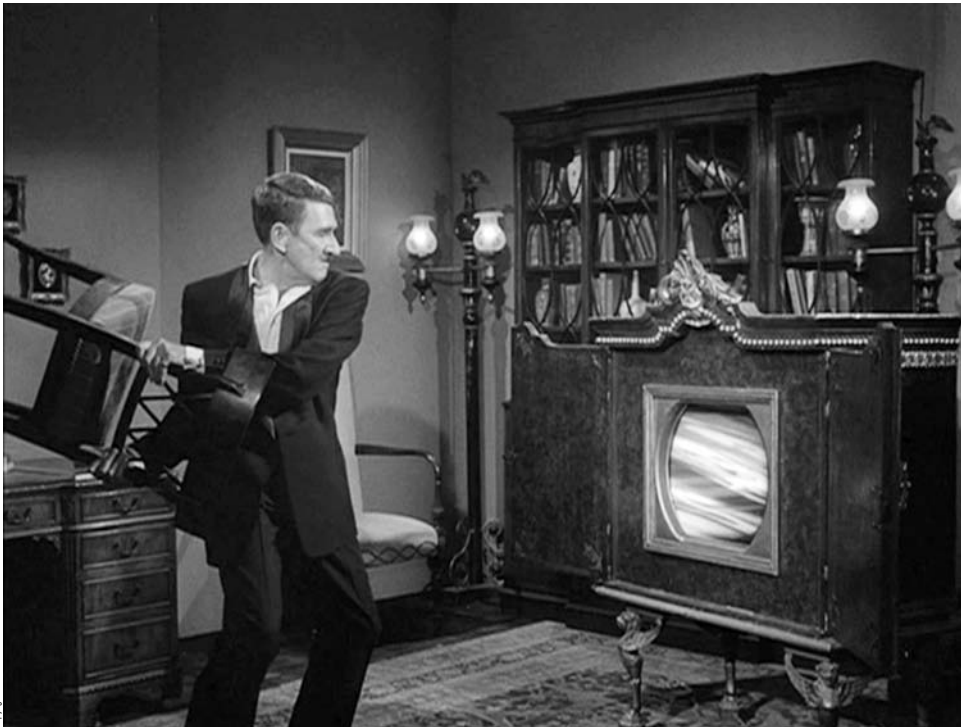
Technophobic Bartlett Finchley (Richard Haydn) attacks his nemesis ("A Thing About Machines," 1960)

Similarly, in Serling’s “A Thing About Machines,” a snooty writer’s elegant home is, it appears, haunted. Bartlett Finchley (character actor Richard Haydn) is “a practicing sophisticate,” who “writes very special and very precious things for gourmet magazines and the like” when he is not kicking his television set and denouncing the “mechanical contrivances” of modern life. At first glance, this episode appears to evoke the critique of consumerism and gadgetry that was almost requisite among American intellectuals during the postwar years. (Max Lerner, to choose