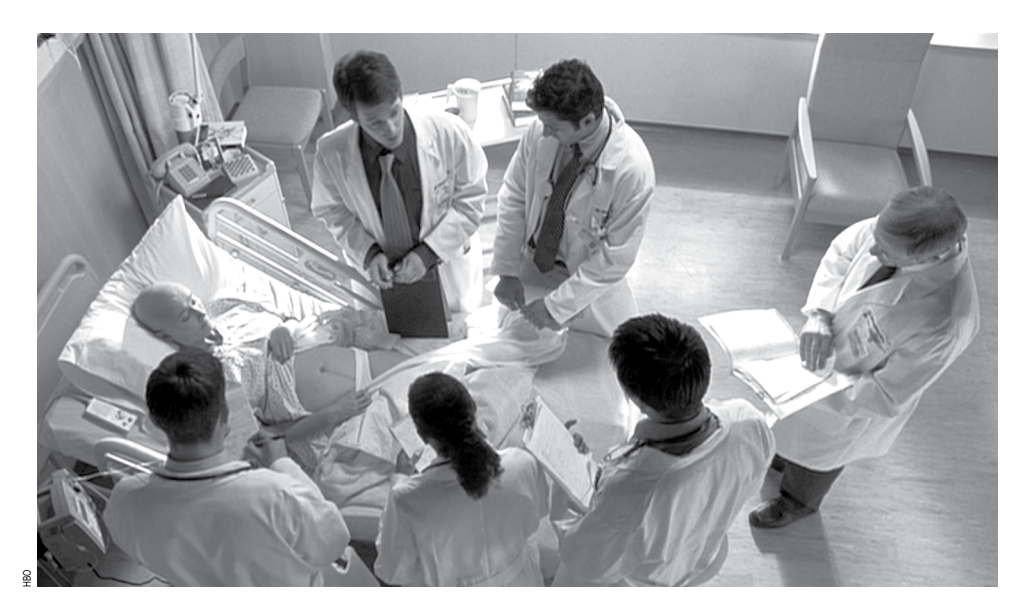
Grand rounds: Professor-turned-patient Vivian Bearing (Emma Thompson in the HBO movie) is examined by Dr. Kelekian (Christopher Lloyd, far right) and his medical fellows.

For the kind of scientists that Kelekian and his team of eager young researchers represent, the unique and unrepeatable human being can only be seen as a collection of mathematized parts—measurable creatinine levels, calculable lymphocyte cells, quantifiable bilirubin secretions. Seeing universally and deeply, but still only narrowly, such scientists fail to see the forest for the trees; they remain methodologically unaware of the particular named human being who is the particular human patient whom they study and treat. Efforts to inculcate in young research doctors a sense of their patients as human beings, even if only to help them "converse intelligently with the clinicians" and to improve their bedside manner, are considered by the researchers to be a waste of time.